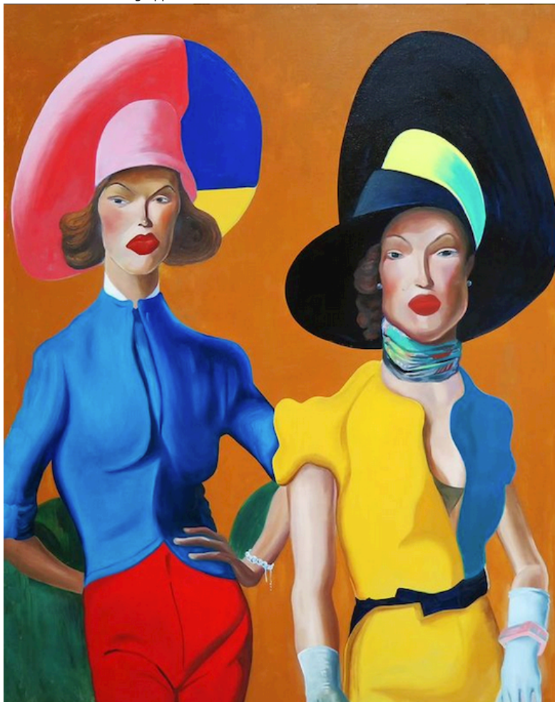
NOAH BECKER – NEW PAINTINGS . . . 'Two Figures in Hats', 2023 oil on canvas / 48 x 36 in. image via Instagram @notforthemnyc PHOTOS FROM THE OPENING – BY NANCY SMITH

WHITEHOT MAGAZINE & NOT FOR THEM Present: 'BEGGARS BANQUET 2', OPENING MON NOV 20, 2023 / 6 - 9 PM NOT FOR THEM, 28 LOCUST STREET, BROOKLYN, NY 11206 email: Noah@whitehotmagazine.com for installation images / or to make a viewing appointment